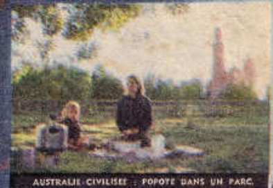
AUSTRALIE CIVILISÉE : PÔPÉE DANS UN PARC.