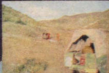
SUR LE MONT ATHOS, LE BEAU JOUR DE NOËL.