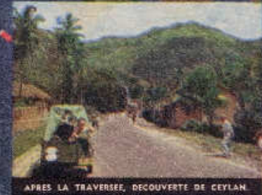
APRÈS LA TRAVERSÉE, DÉCOUVERTE DE CEYLAN.