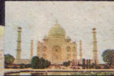
LES MONTIN EN GROUPE DEVANT LE TAJ MAHAL.