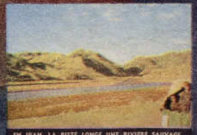
EN IRAN, LA PISTE LONGE UNE BIVIERRE SAUVAGE