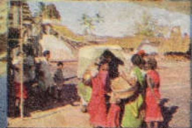
INDES DU SUD : DES FEMMES TRÈS CURIEUSES.