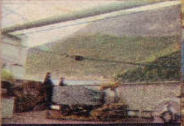
PELOPONÈSE : VISITE RAPIDE À L'ÎLE D'ULYSSE.