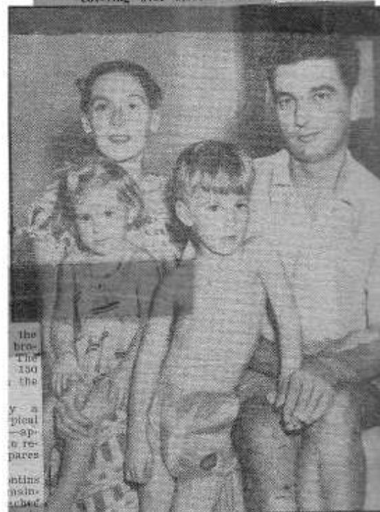
the bro. The 150 the y a pical -sp a re-pares mtins psin-ached