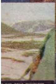
DES COLS ENNEMIS