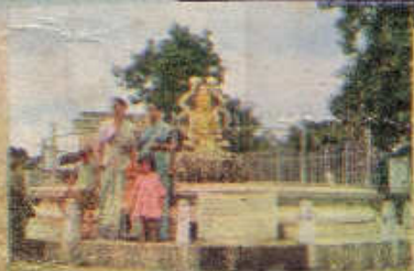
AU PUNJAB, EN COSTUME LOCAL DEVANT SHIVA.