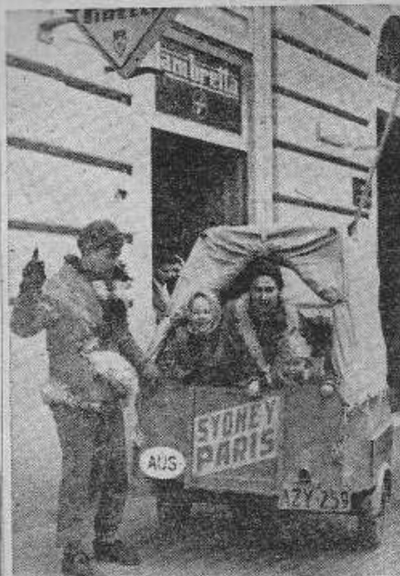
La famiglia australiana durante la sosta a Brindisi