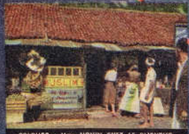
COLOMBO : Mlle MONIN CHEZ LE BIJOUTIER.